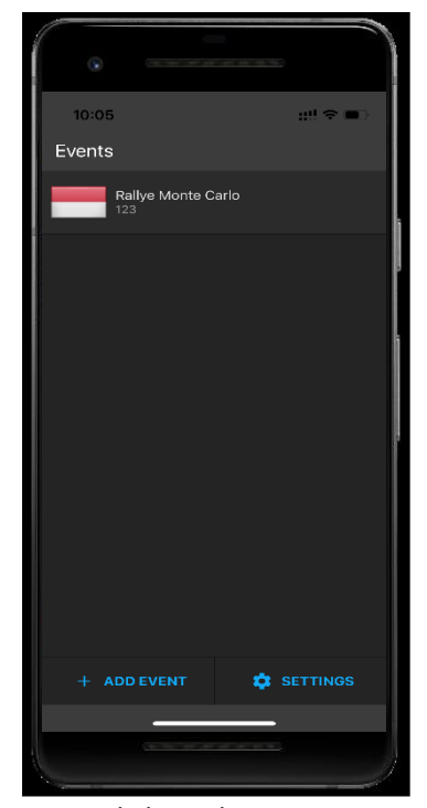
Click on the event.

Once the application is installed on your device and the entry code is entered you can see the event in your home screen.