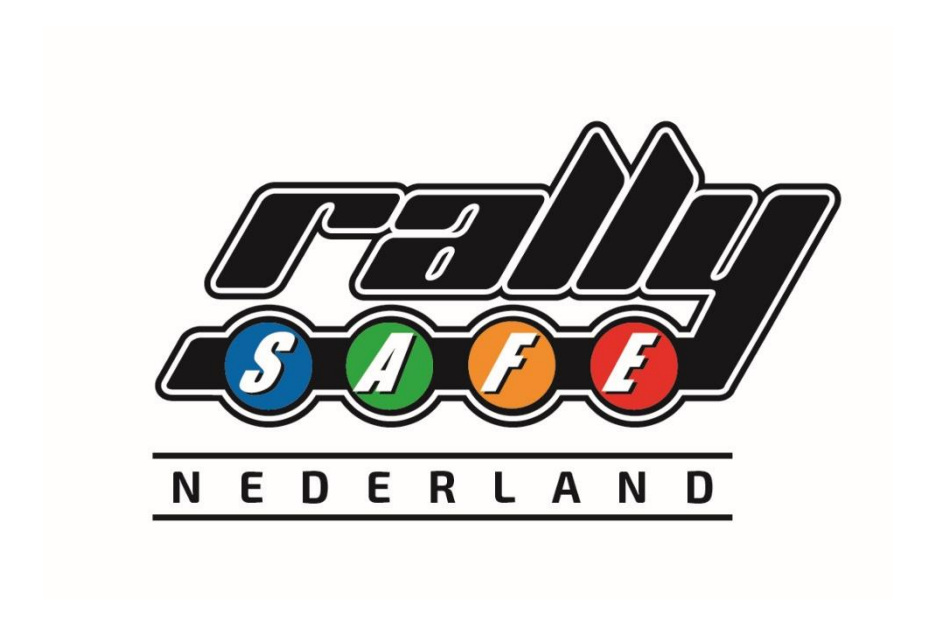
RSLite – User manual for Recce