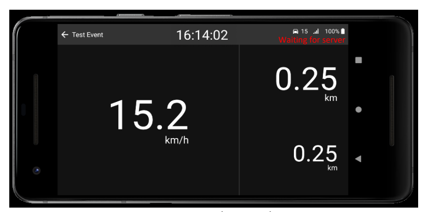
Main Screen when tracking.

The main screen shows you the event time, the current speed and has 2 odometers that can be reset by pressing the odometer.