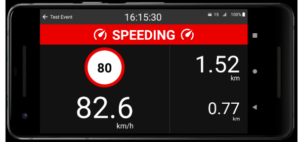
When the device detects an overspeed this device will warn the user with an audio tone and a red bar as seen in this example.

For the best operating experience, it is highly recommended to always keep the RSLite application open at any time, being visible for driver and/or codriver. Please do not minimize the application on stage. In transit sections the phone can be used for other purposes like texting or navigation, but the application should be visible and on as much as possible.