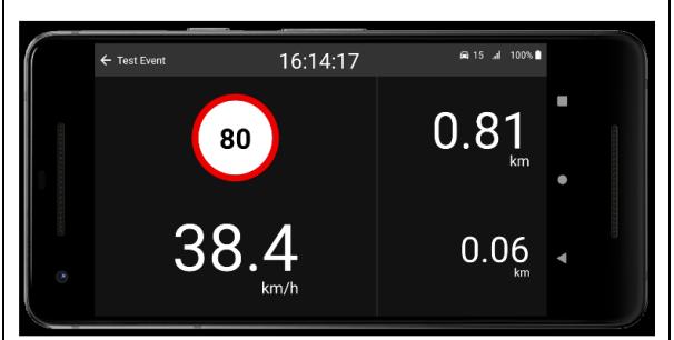
When entering a stage, the speed limit is shown above the current speed. In this example the speed limit is set to 80km/h

There is no input needed from the competitor to use the application once setup, the device will detect by itself if it is deemed to be on a section where speed limitation applies. Once you arrive to any stage the application will show you the speed limit on stage or section and warn you when you are speeding. Please keep in mind that this application works on GPS and all stages are considered active, depending on the layout it might be possible to see unexpected speed limitations when for example you drive on a highway close to a stage or even where the stages cross a main road.