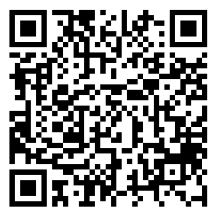
[ Google Play Store for Android ]

In order to install the application RSLite on your device please search for 'RSLite' in the app store, alternatively you can scan the QR code below corresponding to the operating system to go direct to the application.