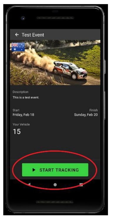
Click on 'Start Tracking'